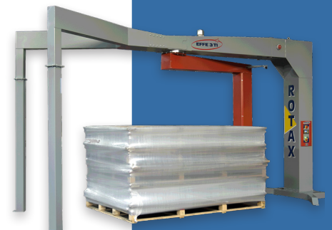
FOR BIG PRODUCTS