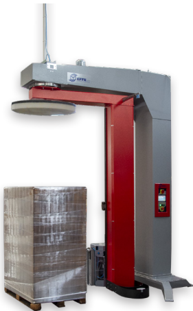
WITH STABILIZING PRESS